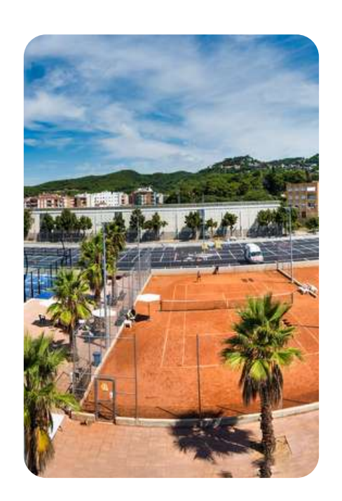
Excellent Sport Infraestructure

With 35.424 sports areas, Catalonia has more sports facilities than any other region in Spain