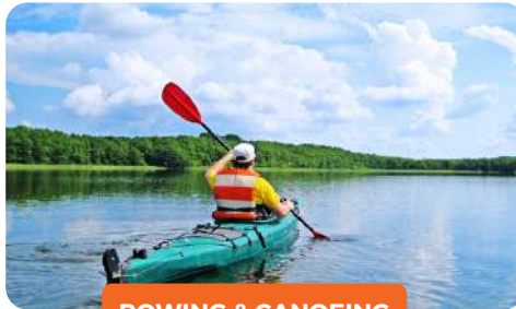
ROWING & CANOEING