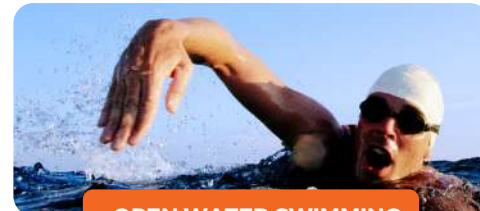
OPEN WATER SWIMMING